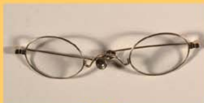
Spectacles Spectacles case Reading glasses